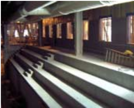
Central Athletic Facility at Massachusetts Institute of Technology