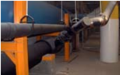
Prudential Center Complex